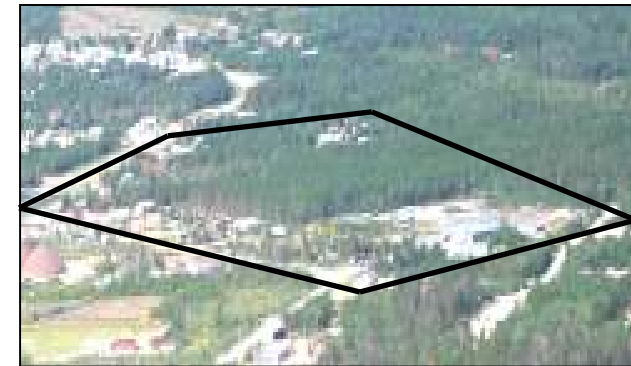
New lots are untouched and ready for development